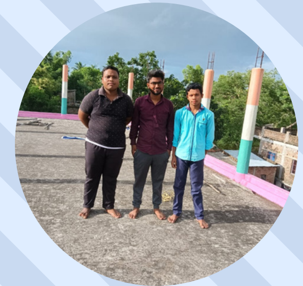
Swastick YCTC Staff